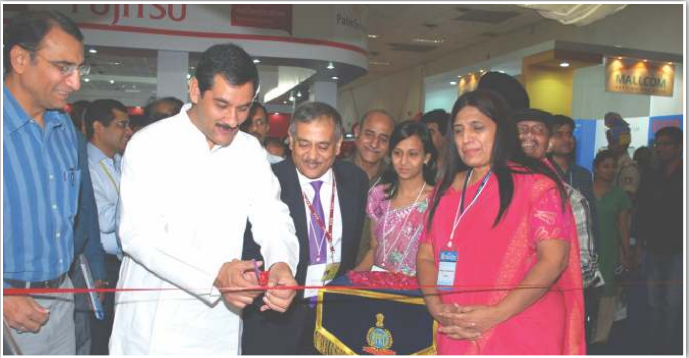
Union Minister of State for Home inaugurating the BPR&D Stall at the 14th India International Security Expo

Hon'ble Minister of State (MoS) for Home Affairs, Govt. of India, Sh. Jitender Singh, inaugurated the Bureau of Police Research and Development (BPR&D) Stall at 14 th India International Security Expo opened on 12 th October, 2011 at Pragati Maidan, New Delhi. Shri Vikram Srivastava, DG, BPR&D and Smt. Nirmal Chaudhary, Director (Spl. Unit) and Sh. M.K. Chhabra, Director (Mod.) were also present during the inauguration ceremony.