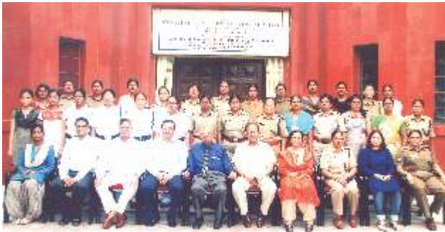
Participants of the workshop with faculty members of CDTs Kokata