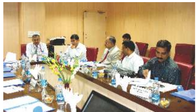
DG, BPR&D chaired the meeting on "Counter terrorism Capacity Building at Police Station level"

A meeting of Micro Mission:06 was held in the BPR&D, HQrs on 6 th Sept. 2011 to discuss the project on Counter Terrorism Capacity Building at Police Station Level in Naxal affected areas. The following decision were taken in the meeting:-