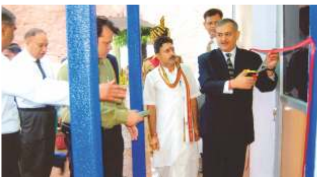
DG. BPR&D inaugurating the Camp office of CAPT

Central Academy for Police Training (CAPT) conducts course on "Anti Trafficking Course" from 10-22 nd October, 2011 at its camp office a Jawahar Lal Nehru Police Academy, Sagar (MP).