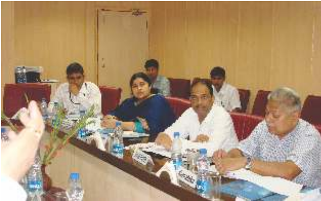
The presentation on "Court Monitoring system" being held at BPR&D Hqrs.

A presentation on "Court Monitoring System" was made at the BPR&D, Hqrs. on 24th August 2011 by APTRANSCO, Vidyut Soudha, Hyderabad. The Company representative said that Court Monitoring System project is a tool to monitor trial of PT Cases for the better conviction and latest suggestion. The salient features of the project are :