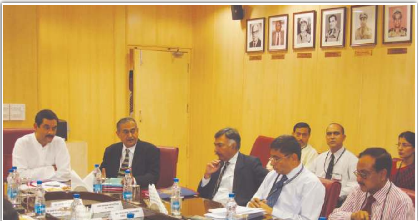
Sh. Jitender Singh, Union MoS for Home having meeting with DG, BPR&D and other senior officers of Bureau at the BPR&D Hqrs.