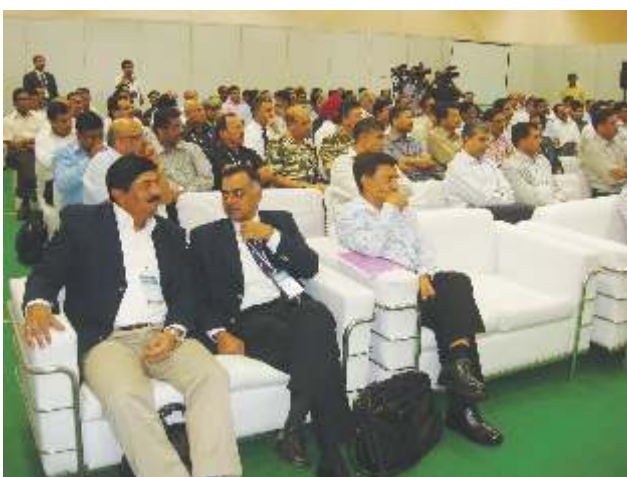
Senior Police Officers among the audience attending of the Seminar

The Conference/Exhibition on safe and secure city was organized by FICCI at Hotel Lalit, New Delhi on 28 to 29th July 2011 and attended by the officers of the Bureau.