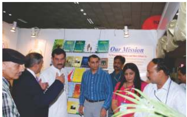
DG, BPR&D explaining about Bureau's working to the Hon'ble Minister