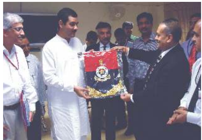
DG, BPR&D presented memento and insignia to the Hon'ble Minister

premises and personally met all the officers and staff of Bureau.