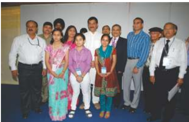
Sh. Jitender Singh, Union MoS for Home with BPR&D officers and staff