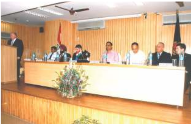
One of the members of specialized training team addressing the trainee officers

CDTS Chandigarh organised the FBI Course “ ATA 8540 Identification and Seizure of Digital Evidence ” from 18-26 th August, 2011.