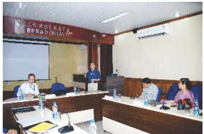
A View of the Workshop held at CDTs Kolkata

The first workshop on “Restructuring of Civil Police” was held on 16 th August, 2011 at BPR&D Hqrs. Representatives from Jammu & Kashmir, Punjab, Himachal Pradesh, Harayana, Rajasthan, Uttar