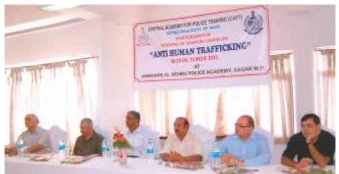
Inaugural ceremony of the "Anti-Human Trafficking Course"