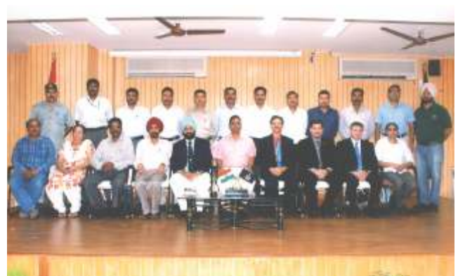
Participating Officers with the specialized trainers on completion of the Course