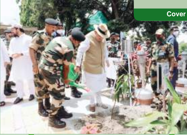
Union Home Minister & Minister of Cooperation Shri Amit Shah takes part in a tree plantation drive at Tin Bigha in West Bengal.