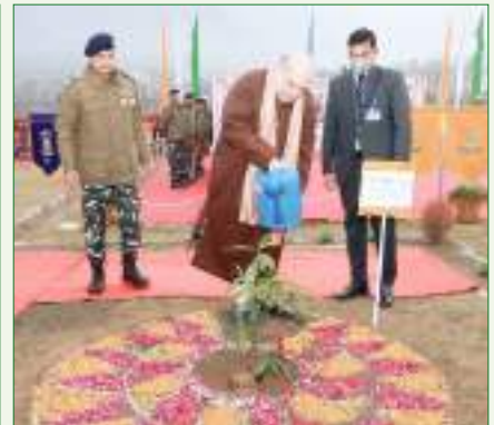
Union Home Minister & Minister of Cooperation Shri Amit Shah plants a sapling at Lethipora, J&K.