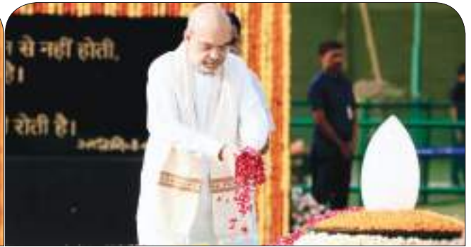
Prime Minister Shri Narendra Modi and Union Home Minister and Minister of Cooperation Shri Amit Shah pay floral tributes to former Prime Minister Shri Atal Bihari Vajpayee at the Sadaiv Atal on the leader's fifth death anniversary.