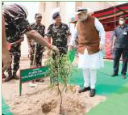
Union Home Minister & Minister of Cooperation Shri Amit Shah plants a sapling at Kishanganj in Bihar.