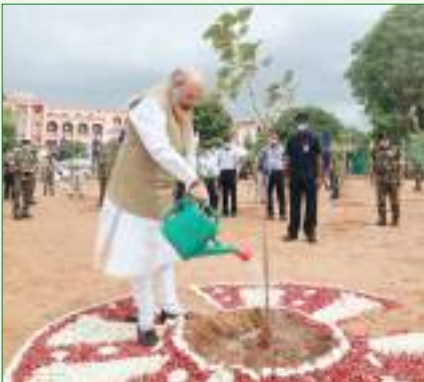
Union Home Minister & Minister of Cooperation Shri Amit Shah plants a sapling at Guwahati in Assam.