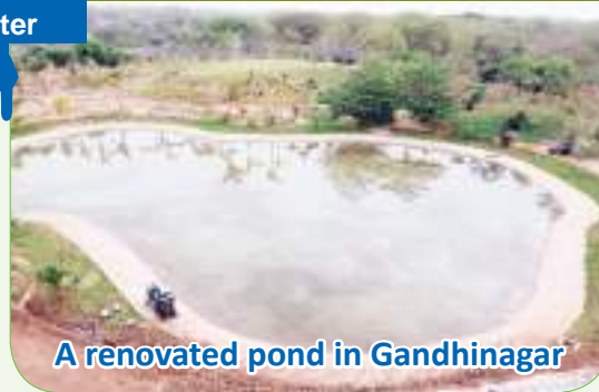
A renovated pond in Gandhinagar