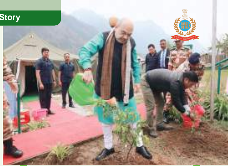
Union Home Minister & Minister of Cooperation Shri Amit Shah at a plantation event at Kibithu in Arunachal Pradesh.