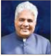
Shri Bhupender Yadav